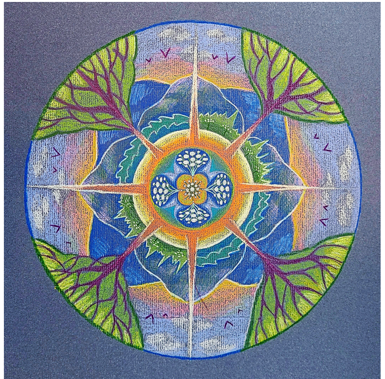
Student work. Olivia, Mandala.

Expressive Arts Extension: Walking the Circle 57