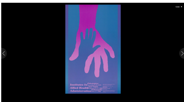
Show images from eBooks as a slideshow.