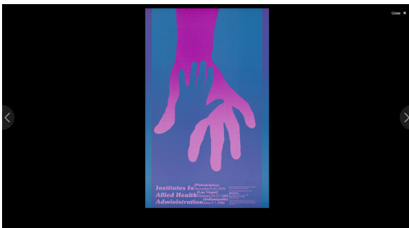
Show images from eBooks as a slideshow.