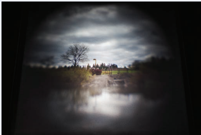
Fig. 1-12. Image of the ground glass viewing screen in a camera obscura.

pinholes in camera obscuras, producing sharper and brighter images. Mirrors were placed in the camera obscura to project the upside-down image right side up onto a ground glass, similar to the workings of today's cameras.