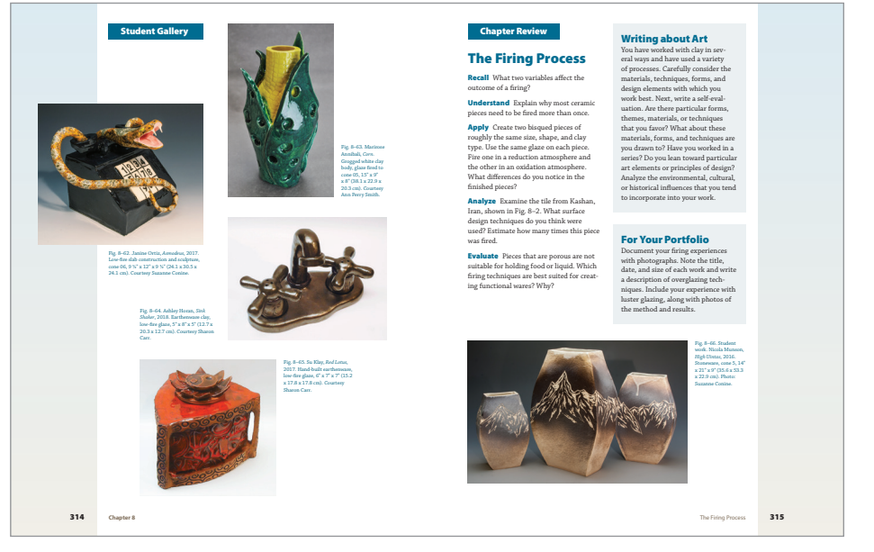
Student Book, Chapter 8: The Firing Process, Student Gallery and Chapter Review.