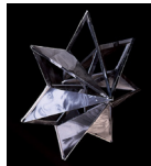
9-11 Student work: Abby Schneider. Mixed media, 12" x 9" x 10" (303 x 281 x 254 cm)

Reflect on the theme you chose for your sculpture. Write about how the photograph, subject, and digital editing support your theme. How does the structure you created help to convey this theme or message? Consider how you might use photographs and 3D forms in future artworks.