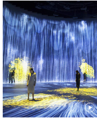
11. The artist collective teamLab uses digital technology as a means made to bring technology and people closer together in the study of nature and science. Viewer's interest with the ever-changing environment. One direct interaction with a digital environment seem more or less intimidating than viewing paintings on a wall in a museum? Why? teamLab, University of Water Particle in the Tank, 2019. Digital Installation in Center of Arts, 100,000 Square meters, Teikyo University, Tsukuba, Japan, 2019.