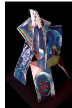
9-11 Student work: David Stewart. Mixed media, 12" x 9" (10 x 228 x 228 cm)

Use a scanner or digital camera to input photographs of six people or objects that are significant in your life. Open each image in a photo editing program. Crop each image to an 8" x 8" square. Use a lasso or other selection tool and copy the person or object on each image onto a second layer directly above