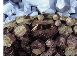
9-11 Imagine the basic photograph from which this work is made. How does the use of three-dimensional objects help add complexity and mystery to the scene?

Katerina Kerenekis and Kerenekis, Dorothea, for the Kerenekis, © M.A. 17, 2008