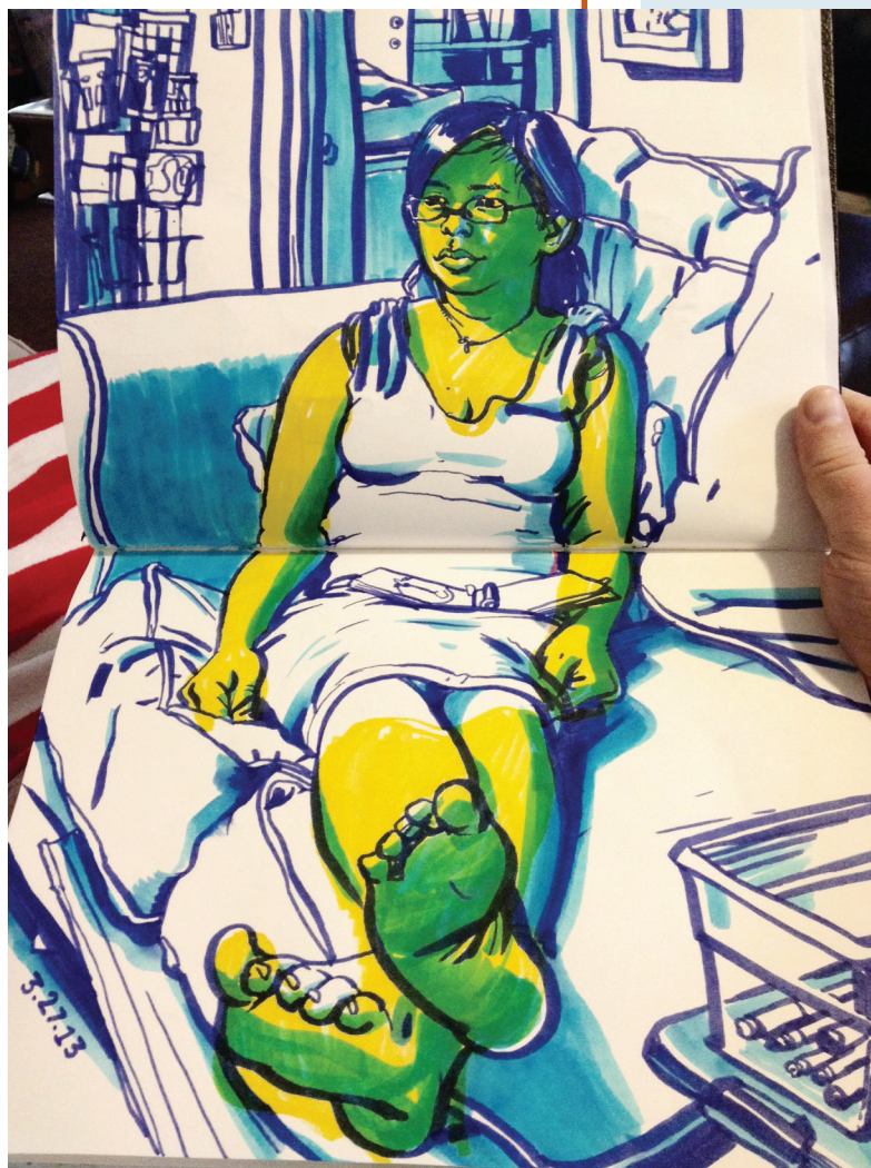
Fig. 1–12. You don't have to use just one page at a time in a journal—you can draw in it any way you like.

Rama Hughes, Sketch of My Son's "Toyceratops," 2013. Pen, 7" x 5.5" (18 x 14 cm).