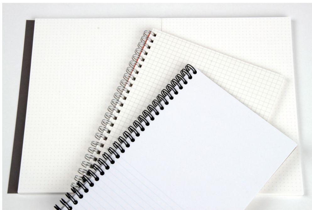
Fig. 1–10. You never know what medium you'll want to use, so choose paper that is suitable for a variety of media.