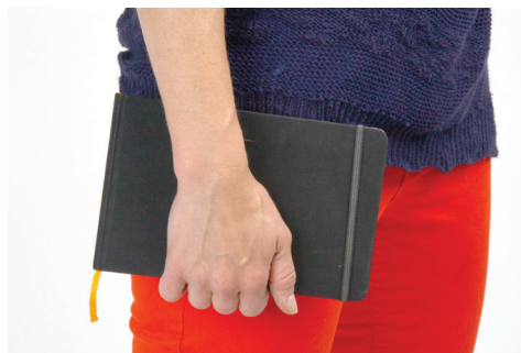
Fig. 1–9. Small journals are easy to carry around with you.