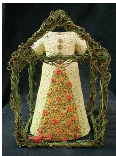
See page 225