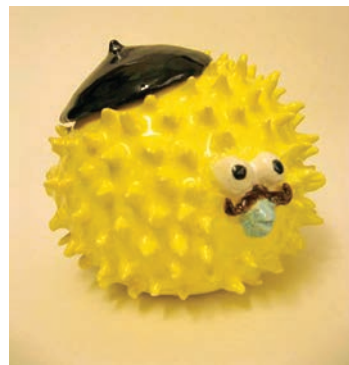
See page 194