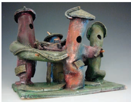
See page 28