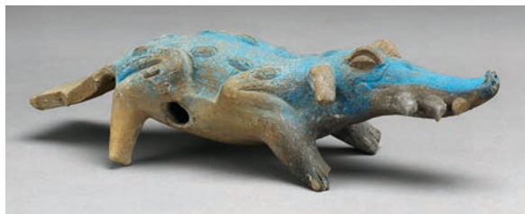
See page 58