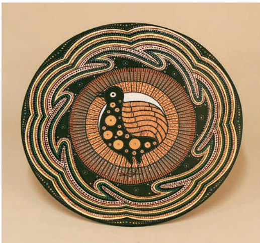
See page 159