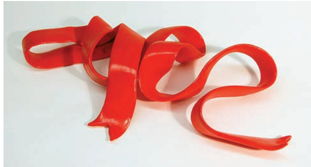
See page 188