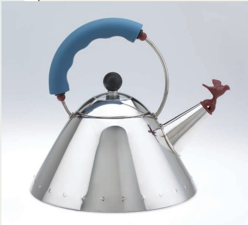
Fig. 1-9. "Model 9093" was produced in 1985.

Michael Graves, Whistling Bird Teakettle .