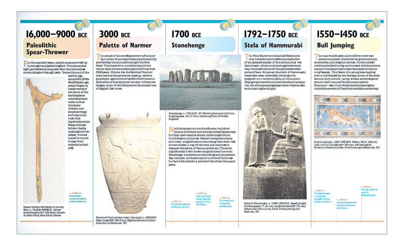
History Through Art Timeline