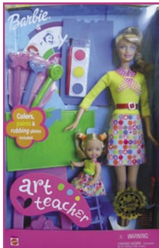
Art Teacher Barbie, one of the career series.

Digital imagery alone can yield salient discussions that help students make more informed decisions about what to think and