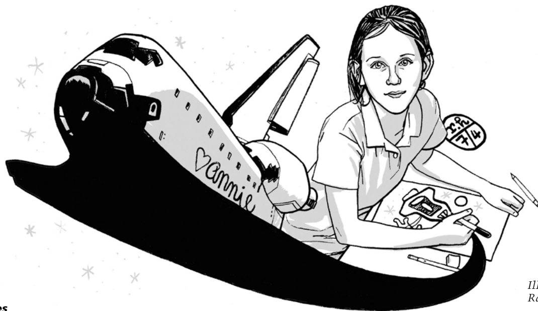
Illustration by Rama Hughes.